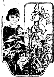
Type of Perfect Lily.

In growing Easter lilies from seeds the time of planting depends upon how the florist intends to handle his stocks and possibly upon which his seed becomes available, says the Bureau of Plant Industry, United States Department of Agriculture, in discussing the results of experiments with growing the flowers from seed instead of from bulbs. Sowing they say, can be done