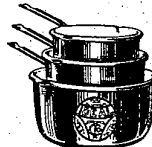
4-Quart Covered Sauce Pan $1.29