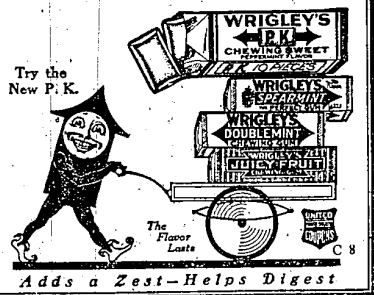
Adds a Zest—Helps Digest