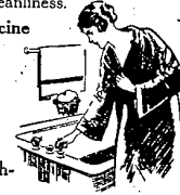
Cleanliness Demands More Than Baking