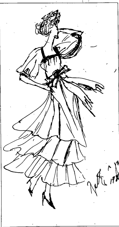
That unusual black evening dress you've been seeking could be created just for you by designer Betty Baga.