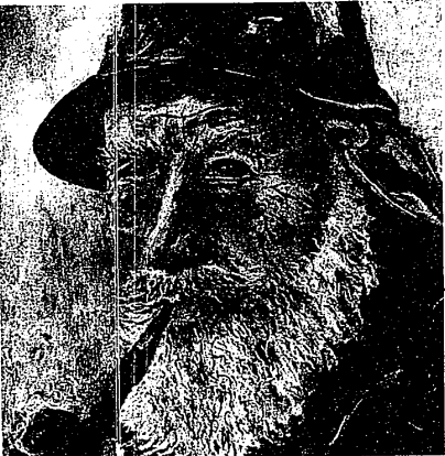
FISHERMAN FROM NEW HAVEN, SCOTLAND