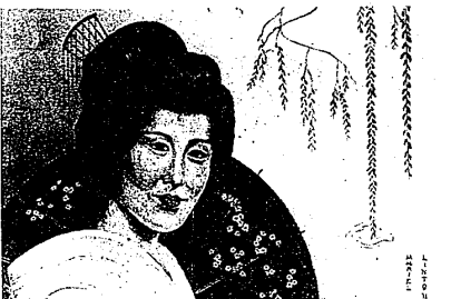
WILLOW OF THE EAST

there a few years ago to make teaching and painting her full-time occupation.