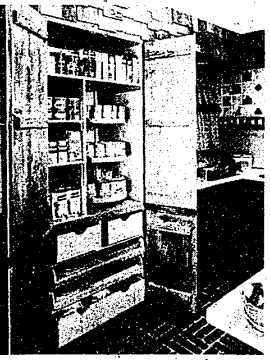
A tall food file represents the ultimate in organized storage behind cabinet doors. This one includes shelves for canned and packaged goods, a revolving rack, slide-out drawers for bottles and cooking utensils.

A kitchen that fires you out needs work. NHIC points out that while energy-saving kitchen improvements can be do-it-yourself jobs, more difficult projects require a home improvement contractor.