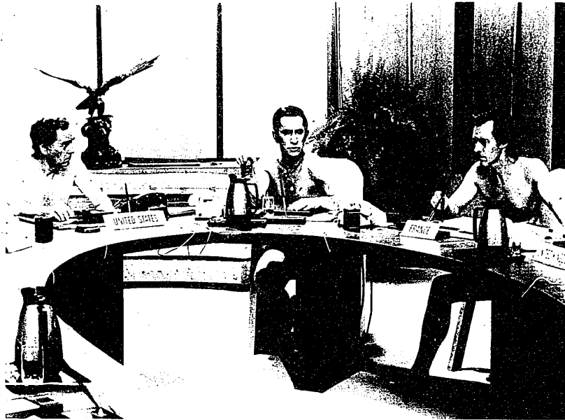
It's a nude bomber

Maxwell Smart (Don Adams) attends a meeting of the Security Council while flanked by United States Ambassador (Walter Brooke) and French delegate (Patrick Gorman). It's all part of the madness of the new movie, "The Nude Bomb."