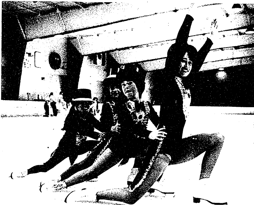
'Give our regards to . . .'

On Saturday evening after sale hours, "our merchants of Greencastle will celebrate with a picnic," she said. Greencastle subdivision entrance is on the south side of 12 Mile Road, between Middlebelt and Inkster roads.