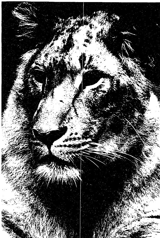
Take a long telephoto and focus in on a single animal, like this lioness, when you go to the zoo.