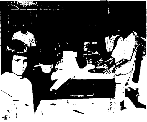
SPLASH OF PAINT is evident as these youngsters participated in the "Back to School" contest conducted by the Wonderland Shopping Center as one of the highspots of its annual back to school sales event.