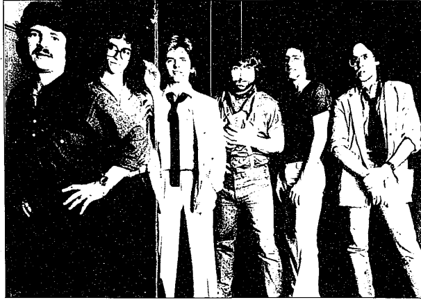
Toto is (from left) Bobby Kimball, Steve Porcaro, David Hungate, David Paich, Steve Lukather and Jeff Porcaro.

Toto, which has been on tour on and off since January, played two nights last week at the Royal Oak Music Theatre and one night at Canton Township's Center Stage. The band features guitarist Steve Lukather, keyboardist David Paich, bassist David Hungate, vocalist/keyboardist Bobby Kimball, drummer Jeff Porcaro, and Jeff's younger brother, Steve Porcaro, who is responsible for keyboards and electronics. Toto opened a recent show with the title tune from its second album "Hydra" (Columbia). Paich, who was dressed in tall hat and coat, sang as he teased the audience with his lively antics. Kimball came up front in knee-high white boots to sing "St. George and the Dragon." Bassist Hungate remained in the background throughout the show. All the while the band filled the audience with songs like "Child Anthem," "Mama," "Good-bye Girl" and "White Sister."