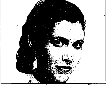
Carrie Fisher again is the strong-willed and beautiful Princess Leia Organa.

ALL THIS LEADS to an ending which is decidedly downbeat, but it also points toward a confrontation of Luke and Darth Vader in part six, the final film of this middle trilogy. By then, having built up an equity in three films, who could afford to forego the other six? And who would want to? Not anyone who wants to stay in touch with what everyone else is seeing and talking about in the '80s.