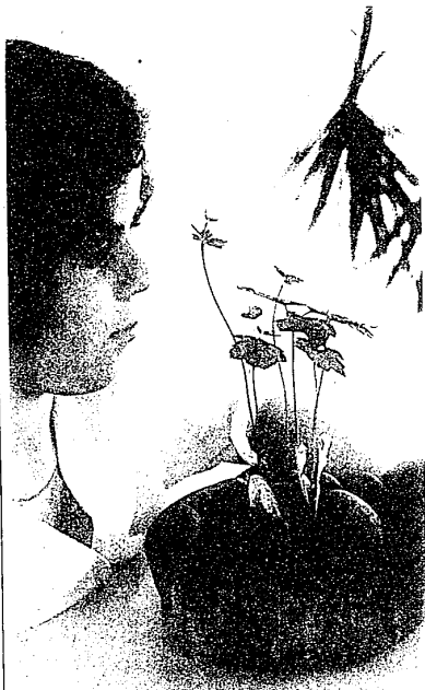
Plant a few seeds and a mini-tree will begin to unfold.