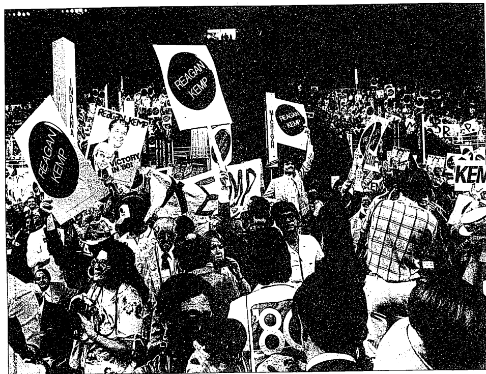
Cheerful delegates urged Gov. Ronald Reagan to pick New York Congressman Jack Kemp, former pro football quarterback, as his vice presidential running mate.