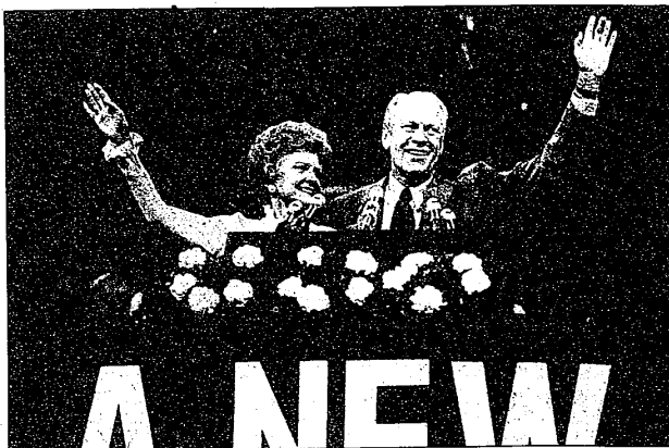
Betty and Gerald Ford waved to the crowd from the podium Monday evening before Ford offered his remarks on the future of the Republican party.