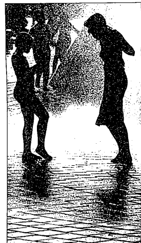
As the temperatures outside the Joe Louis Arena soared into the 90s during convention week, several visitors took advantage of the water fountain in Hart Plaza to cool off.