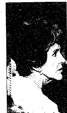
Nancy Reagan attended the convention sessions while her husband Ronald followed tradition and stayed away from the Joe Louis festivities.