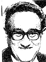
HENRY KISSINGER

To counter this, Kissinger called for a "purposeful" long-range policy.