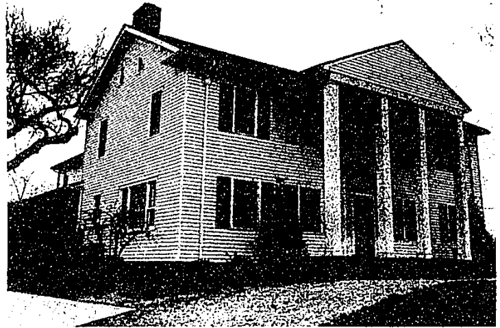
The Philbrick Tavern, located at Power and Eleven Mile, was reputed to have once been a stop along the Underground Railroad.