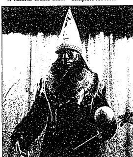
Actor-model Jerry Dillahunty sports a double-breasted otter coat with large shawl collar of raccoon.

Toe tappin' Hand clappin' Big night Bright lights History makin' Record breakin' Lots of pizzaz! It's 'SFALLCAST '80 and all that jazz!!