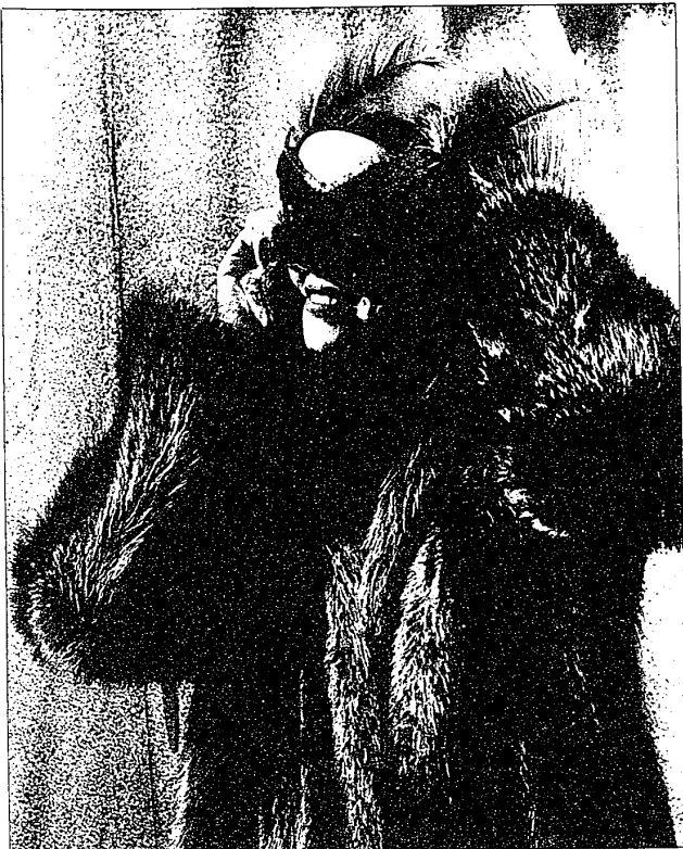
The rage for raccoon goes on. A long-haired favorite that wears well and is in many people's price range, this version has puffed shoulders and a notched collar (above). The bunny is in fox (above left). In this case shadow fox and blue fox worked into diagonal stripes. The wizard and audience register approval.