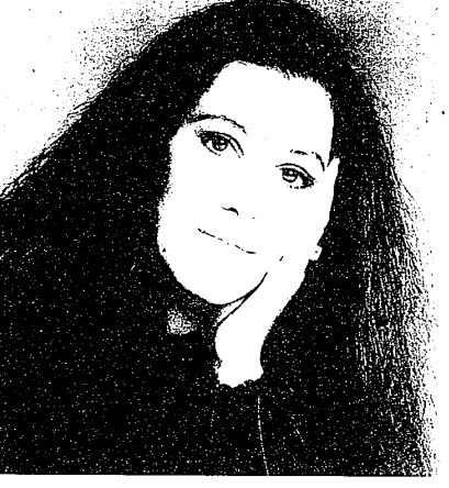
Rita Coolidge will sing at 8:30 p.m. Tuesday at Meadow Brook Music Festival. Her special guest is Booker T. Jones.