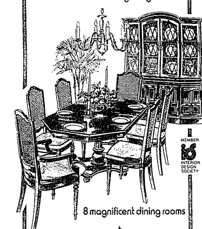
8 magnificent dining rooms