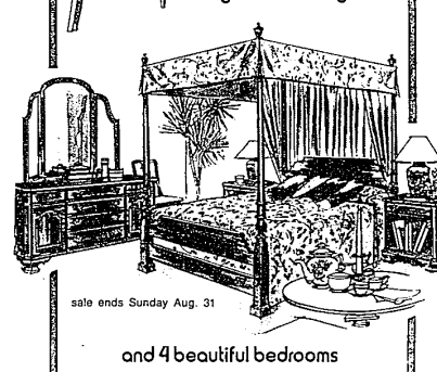
and 4 beautiful bedrooms

Whether you're planning an entire decorating scheme or adding a few new pieces, you'll enjoy outstanding savings on a huge selection of Ethan Allen furniture, floor coverings, draperies, lamps, clocks and accessories — everything to add new beauty and comfort to your home.