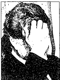
Sen. Edward Kennedy now must wait until 1984.