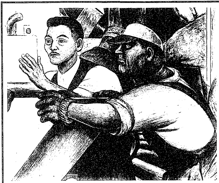
ABOVE: Moving in close to shoot a detail of a painting can give you a photo with impact. This is a detail of "Detroit Industry," the Diego Rivera mural.