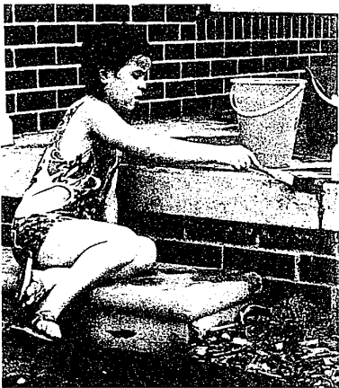
With water, youngsters can paint anything, anywhere without fear of damage.

What about a game of dots? Just keep 'em busy. Sometimes that seems to be the goal of parenting. Just get through the day. Find something to do when there's nothing to do.