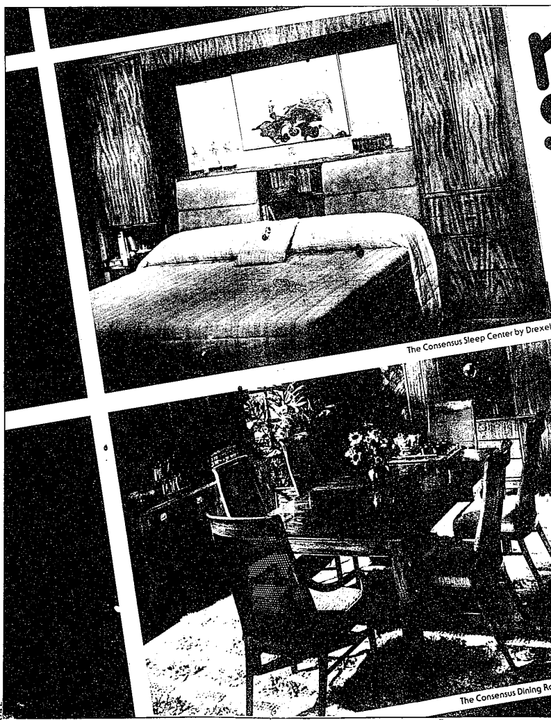
The Consensus Sleep Center by Drexel.