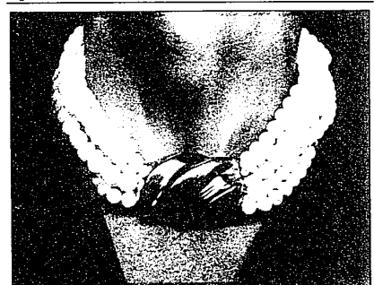
Patricia Von Musulin creates modern fantasy with her nine-strand mother of pearl necklace with beads in three sizes. Clasp and front piece are 14K gold on sterling silver. Exclusive to Ilona, Ltd. of Birmingham, $696.

Well bred suiting in grey wool flannel defines your day in soft heathered tones. Shorter jacket with Chesterfield collar, 118.00 Double-pleated trousers to match, 70.00 The blouse, a floral on teal, raspberry or cream polyester, 45.00 All from Jones New York for 6 to 14 sizes. Sportswear: First Floor