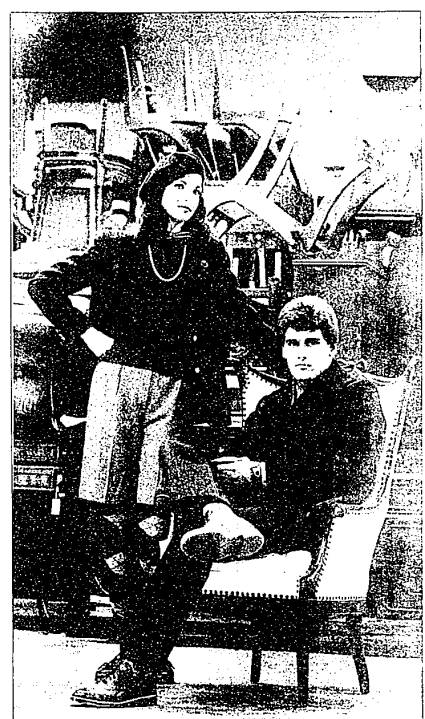
This couple will stir memories with their finds. His navy pea coat, jeans, argyle socks and brown-on-brown saddle shoes are from Hudson's. Her Bermuda shorts in gray flannel, argyle knee socks, classic circle pin, 15-inch pearls, navy blazer, tassel loafer and navy felt beret are also from Hudson's.