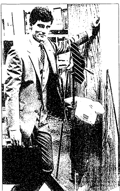
If emulation is the sincerest form of compliment, he'll take a cue from his successful father with a three-piece vested suit, cordovan shoes and briefcase, plus accessories that have stood the test of time.