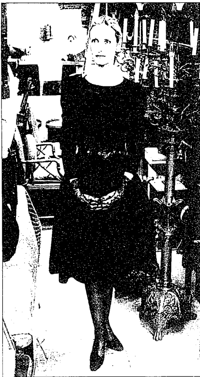
The black velvet long torso taffeta dress is from the new Bill Blass collection but it is reminiscent of great evenings gone by. $178 at Claire Pearone. Lisandro Sarasola's art deco black lacquered and gold leaf belt and a pair of lace gloves from Miss Pearone's family treasures collection.