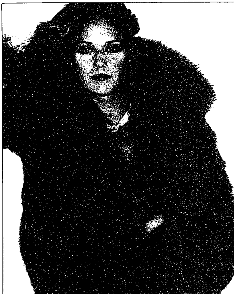
Illustration available in Canadian Fischer, Sable, and Mink, of course.

Our prices are much lower. The duty and sales tax are refunded, plus currently 14% exchange on U.S. funds.