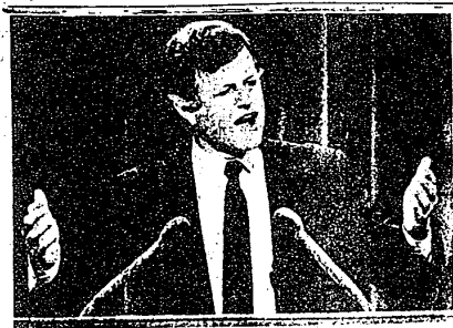
Sen. Edward M. Kennedy, przemawia na Komisji Demokratycznej, atakując Reagana.

YOU'LL FIND no comics in the Dziennik Polski, but a regular feature of the paper is a serialized novel. Novels by Joseph Conrad have been serialized in the past.