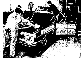
CLEAN CARS are a must for the Livonia Police Dept. and the job of keeping the vehicles that way has been given to the PRO Car Wash, Middle Belt at Seven Mile Road. Car wash attendants are shown putting the finishing touches on a police car.

is of high priority with governmental units, too, as in both Livonia and Redford Township where police departments have chosen the PRO Car Wash across from Livonia Mall.