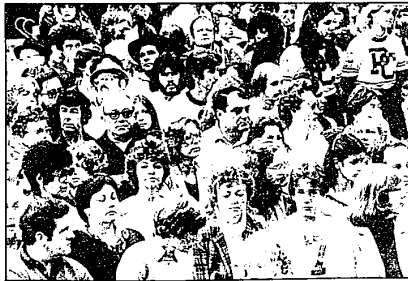
Members of Plymouth's various civic organizations were extras in the audience for a beauty contest sequence in Kellogg Park. Production of "Word of Honor" continued, because of an agreement between Georgian Bay Productions and the striking Screen Actors Guild. Actors and technicians will receive any future benefits from a strike settlement.