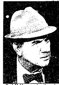
Karl Malden, running through a scene one more time, has become a familiar face around Plymouth.

Screen Actors Guild, the production was allowed to continue because of a previously arranged agreement with Georgian Bay Productions in which actors and technicians will receive any future benefits from a strike settlement.