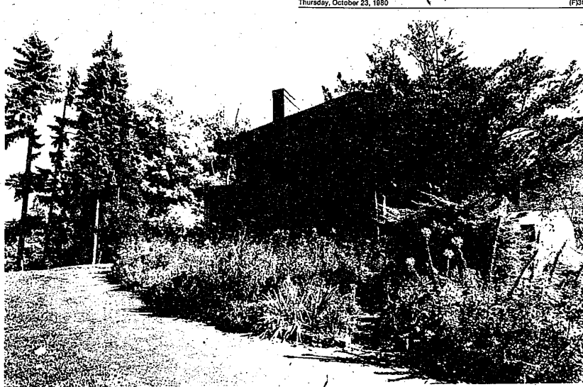
Views of the back and the north side of the Farmington Community Center show some of the flower gardens that make the buildings and grounds as attractive as they are. The gardens have been designed, planted and are maintained by members of Hill and Dale and Farmington Garden clubs.