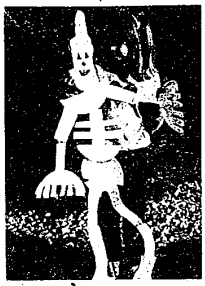
Body form and makeup can be taught with simple elements like paper plates, construction paper and yarn.