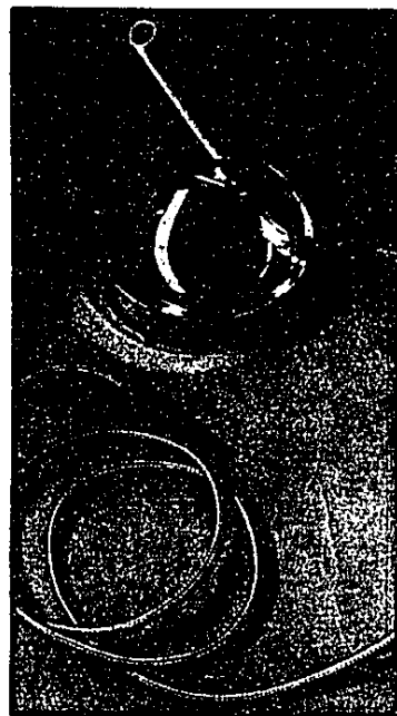
Smokers robot sells for $6 at Rehabilitation Institute.