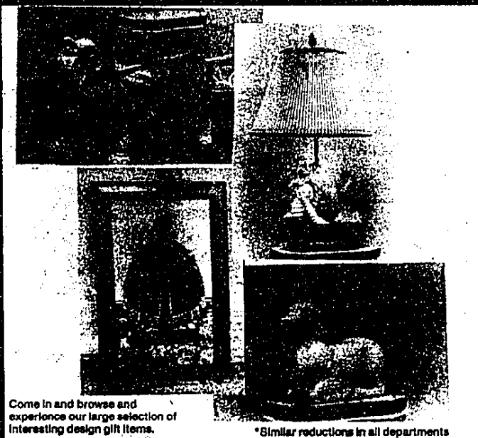
Come in and browse and experience our large selection of interesting design gift items.