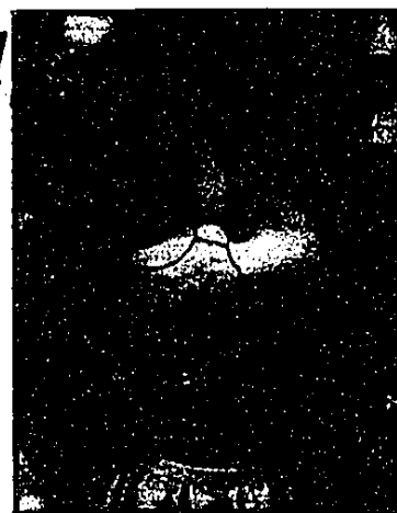
Doll is dressed in removable, washable wear.

be Red Riding Hood, the wolf and grandma.