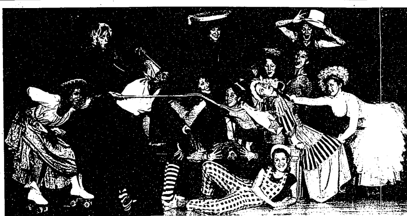
Wayne State University Dance Company will present its annual Dance Concert for Children, in repeat performances, at 1:30 and 3:30 p.m. Dec. 13-14 at the Birmingham Theatre on Woodward.