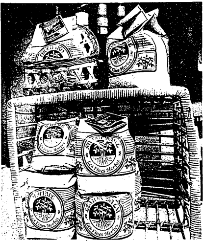
Herb gardens in a sack retail for $5 and are entirely self-contained. Peel back the opening, plant the seeds and follow the diagram on the bottom of the bag to cut holes for drainage. (Staff photo by Randy Borst)

An abacus was used long before man learned to put batteries into a pocket calculator. This one retails for about $8. (Staff photo by Randy Borst)