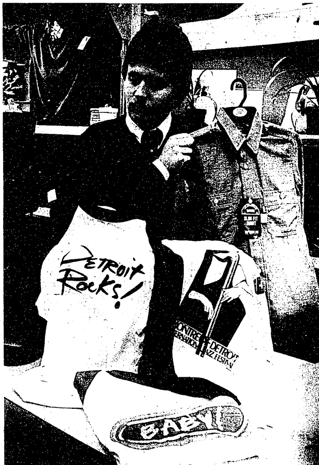
T-shirts with the latest buzz words or a plain old western cut shirt all sell for under $10 at jeans outlets.

An abacus was used long before man learned to put batteries into a pocket calculator. This one retails for about $8.