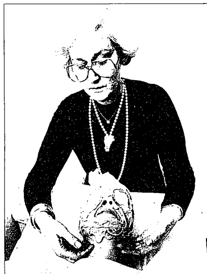
The facial mask is nearly complete and the client, eyes covered with moistened pads, seems to enjoy the treatment.