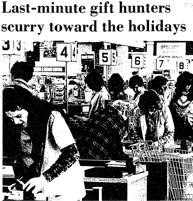
Shop, shop, shop around the clock almost describes the last minute scene in stores throughout the Farmington area as persons who vowed they'd