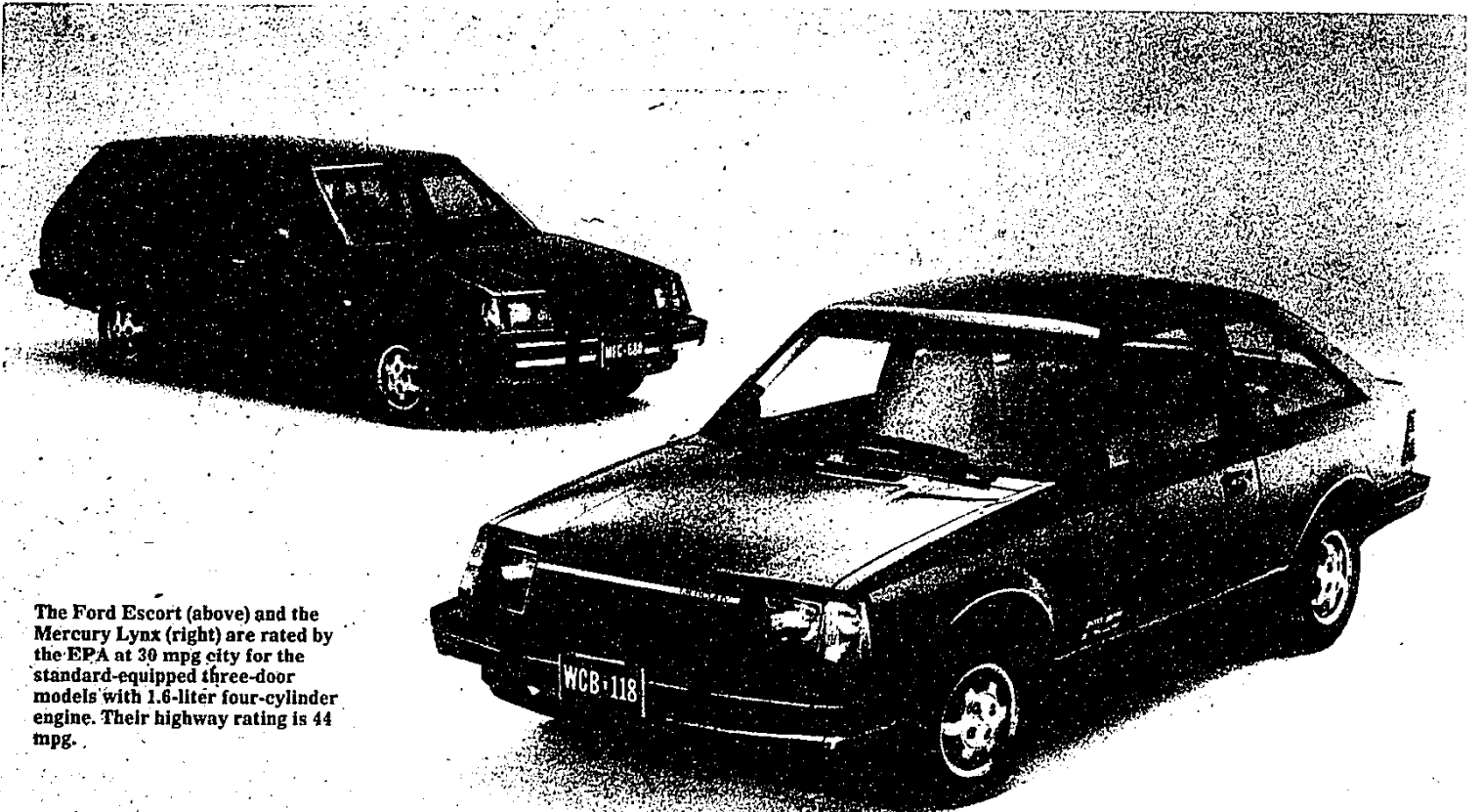
The Ford Escort (above) and the Mercury Lynx (right) are rated by the EPA at 30 mpg city for the standard-equipped three-door models with 1.6-liter four-cylinder engine. Their highway rating is 44 mpg.