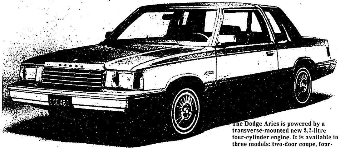
The Dodge Aries is powered by a transverse-mounted new 2.2-litre four-cylinder engine. It is available in three models: two-door coupe, four-door sedan, and station wagon.

The success of the cars introduced this year will affect strongly the fortunes of Ford Motor Co. and probably determine Chrysler Corp.'s future.