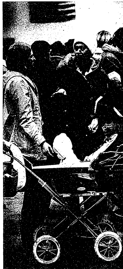
Waiting women pass the time of day with a little conversation.