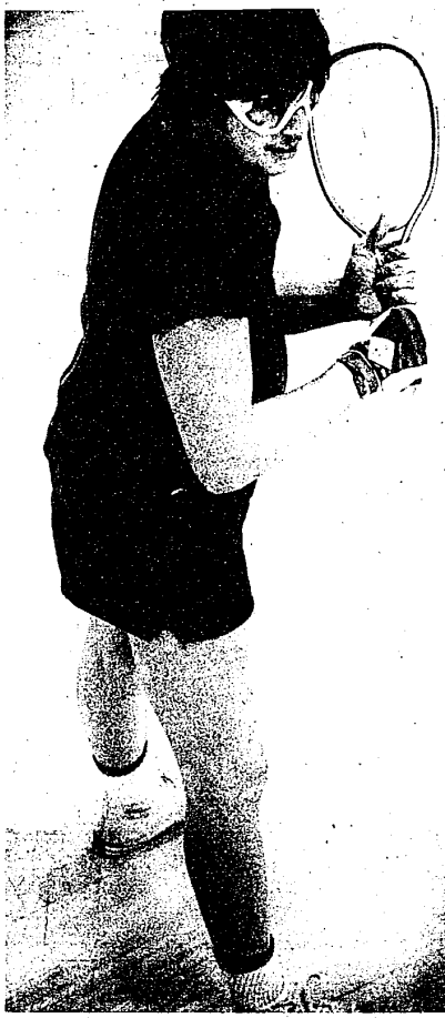
Ready for the next shot, racquetball fan Tom Schlang strikes an aggressive pose at Racquetball Courts of Farmington.