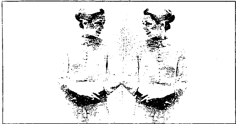
For the sophisticate, an ivory two-piece dress in matinee length can be worn after the wedding as well.