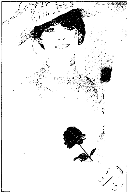
A matching picture hat tops off a romantic look by Milady Bridals. The full-length gown features a re-embroidered Alencon lace bodice beaded with sequins and pearls.