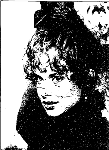
Nastassia Kinski plays the title role in "Tess," based on the Thomas Hardy novel "Tess of the d'Urbervilles."