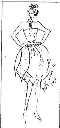
When she returned from visiting the Paris couturiers, Betty Baga Guem brought a variety of new ideas to please her clients. Among them, the straight dress (left), which narrowly tapers from wide shoulders to a banded hem. The short tulip skirt evening gown (right) is cut from silk taffeta in deep floral tones to pale almost white. (Drawings by Betty Baga Guem for The Eccentric)

is couturiers show short skirts just covering the knee or ending at the middle of the knee, there are no dictates.