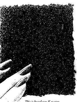
This is brand new Karastan.

If you've always thought Karastan was a bit out of reach, get in touch with your nearest participating Karastan dealer. For a limited time only, he or she can show you specially selected Karastan rug and carpet styles on sale at savings of up to 25%.