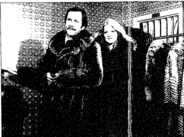
His and Hers Canadian Silver Raccoon, from the Gervais Collection, as seen on Channel 9 11 o'clock news. The Pair.....$5000.

Our Prices are much Lower. The Duty & Sales Tax is Refunded, Plus exchange on U.S. Funds, currently 19%.