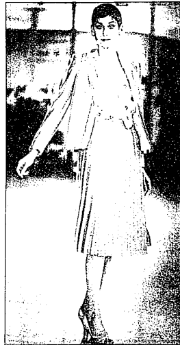
Tiktiner's message is delivered in blue and white stripes and polkadots in a pure silk camisole, skirt and jacket. Approximately $1,150 at Claire Pearone, Somerset Mall.