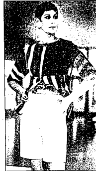
The white Bermuda short is back. Tiktiner turns to pure cotton and tops it with abstract stripes and red cummerbund, $350. Claire Pearone, Somerset Mall.