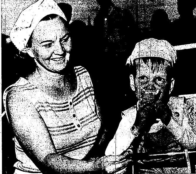
Hard to tell who's enjoying ice cream more — Mom or tiny son.