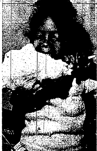
NO VISIT IS complete without a taste of cotton candy. This tiny miss is having a big time with a batch of the sweet stuff most youngsters just have to have at the State Fair.