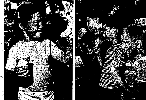
MOM AND POP may enjoy the activities but the kids have the most fun. (Left) This small beauty has a great deal of interest in her new acquisition. (Right) There's nothing more delightful than company when one is enjoying some of the edibles of which there are an abundance.