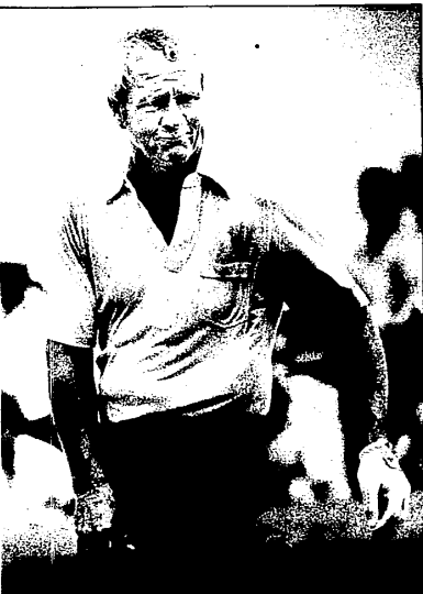
Arnold Palmer had good reason to frown after the first six holes of Monday's playoff as he trailed by six strokes.