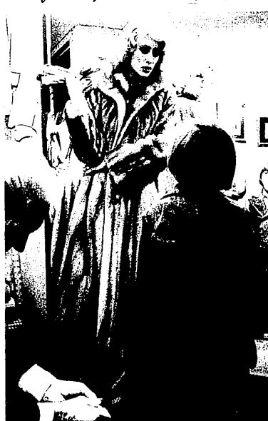
Illustration available in Canadian Fischer, Sabie, and Mink, of course.

Our prices are much lower. The duty & sales tax are refunded, plus currently 19% exchange on U.S. funds.