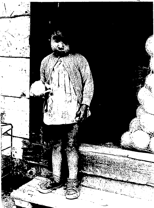
This photo of a Mexican girl by Monte Nagler gets its impact from the background, which complements but doesn't overpower the subject.